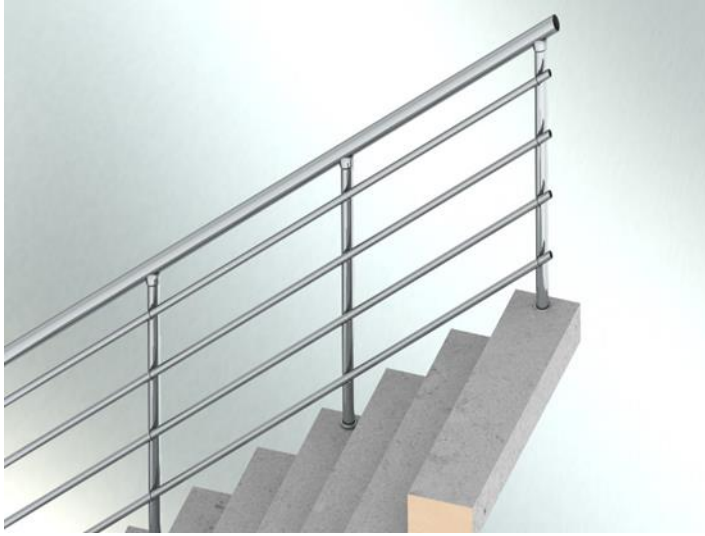
Drawing A3. Sketches of stairwells: